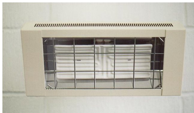
Model No – HLC15 220-240v 1500W

A range of models for general internal installation, providing ceramic medium wave high-energy Infrared heat. With standard models from 1Kw to 4.5Kw, in a range of formats, they offer the instant answer to many zone or localized heating problems. These units can be wall mounted or ceiling suspended and come in single and three phase versions. The case is manufactured from aluminium and is painted in ivory colour powder coat finish. Guards and wall brackets are supplied with all models.