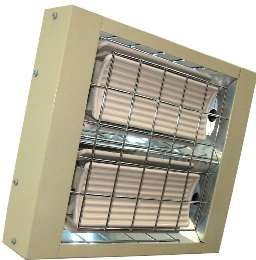
Model No – HLC30 220-240v 3000W

The Ceramic elements emit a high proportion of medium wave Infrared heat, this output is far less intense than the short wave version, and it can therefore be used where low level or space restricted instant heat is required. Ceramic elements produce no visible light, so can also be installed in situations where the red glow from short wave system would make them unacceptable, such as photographic studios, or where colour comparisons are used. To help make the right choice, remember Short Wave produces high output instant infrared heat (burning at around 2000°C) making them ideal for general zone/space heating in commercial and industrial areas of all types and sizes. Medium wave (burning at around 700°C) takes a few minutes to reach peak heat and are more suited to smaller areas, for example, shops, veterinary surgeries, studios, security offices, sheds etc.