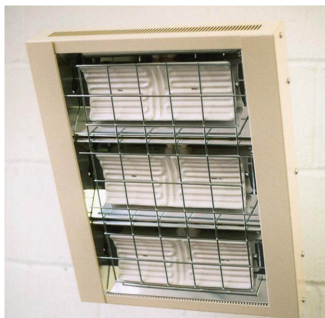
Model No – HLC45 220-240v 4500W Or 380-415v 4500W