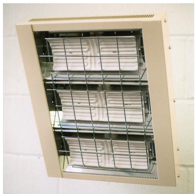
Model No – HLC45 220-240v 4500W Or 380-415v 4500W