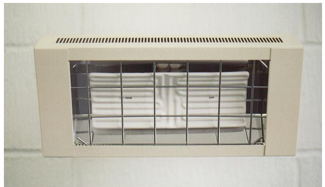
Model No – HLC15 220-240v 1500W

A range of models for general internal installation, providing ceramic medium wave high-energy Infrared heat. With standard models from 1Kw to 4.5Kw, in a range of formats, they offer the instant answer to many zone or localized heating problems. These units can be wall mounted or ceiling suspended and come in single and three phase versions. The case is manufactured from aluminium and is painted in ivory colour powder coat finish. Guards and wall brackets are supplied with all models.