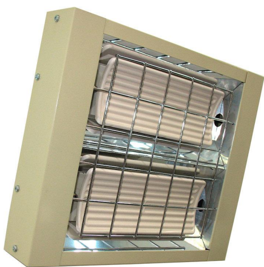
Model No – HLC30 220-240v 3000W

The Ceramic elements emit a high proportion of medium wave Infrared heat, this output is far less intense than the short wave version, and it can therefore be used where low level or space restricted instant heat is required. Ceramic elements produce no visible light, so can also be installed in situations where the red glow from short wave system would make them unacceptable, such as photographic studios, or where colour comparisons are used. To help make the right choice, remember Short Wave produces high output instant infrared heat (burning at around 2000°C) making them ideal for general zone/space heating in commercial and industrial areas of all types and sizes. Medium wave (burning at around 700°C) takes a few minutes to reach peak heat and are more suited to smaller areas, for example, shops, veterinary surgeries, studios, security offices, sheds etc.